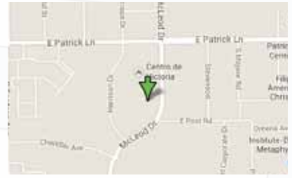
Las Vegas, Nevada

6255 McLeod Drive, Suite 26 Las Vegas, NV 89120 702| 566-3694